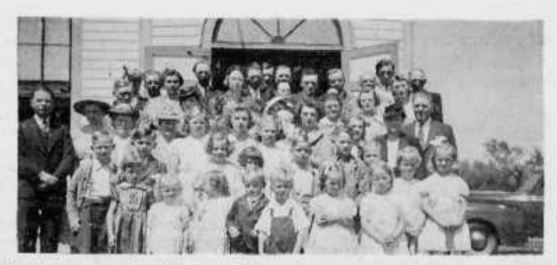
(23 children were baptized. Picture shows children and their sponsors)