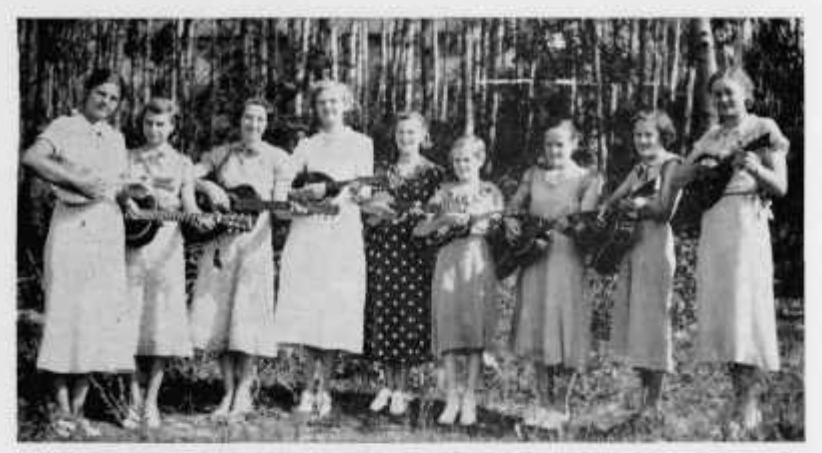
String Band at Lake Metigoshe, 1937