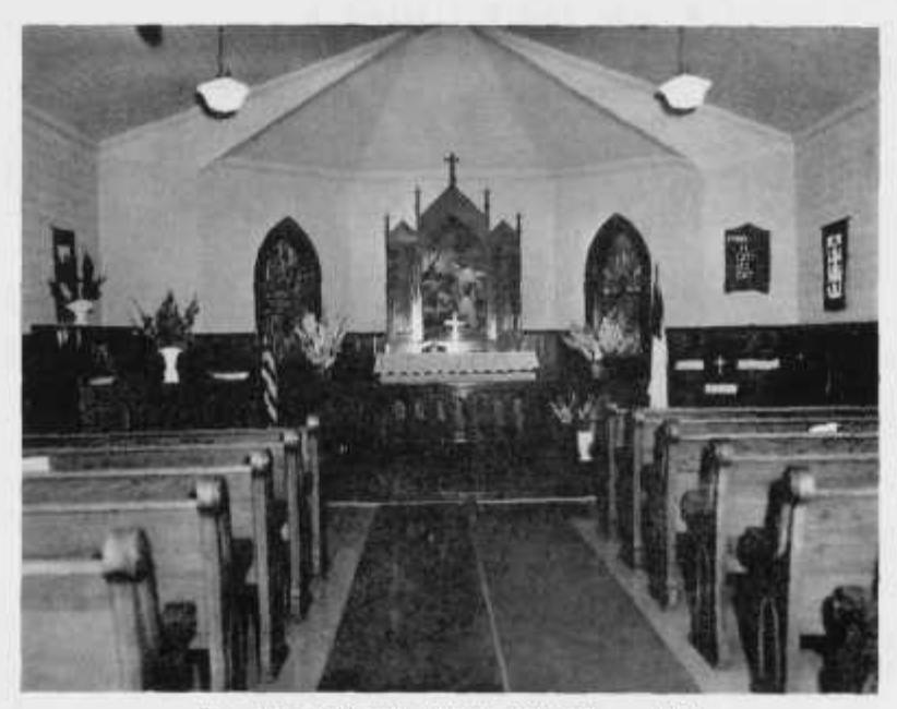
Interior of North Prairie Church - 1949