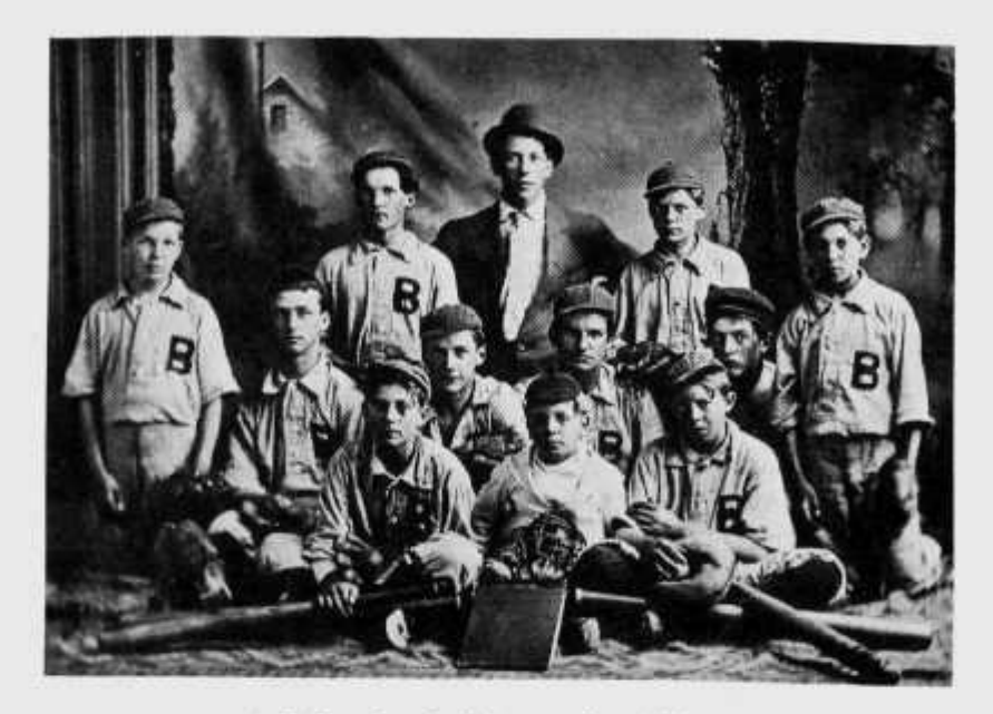
A Balfour baseball team, circa 1909.